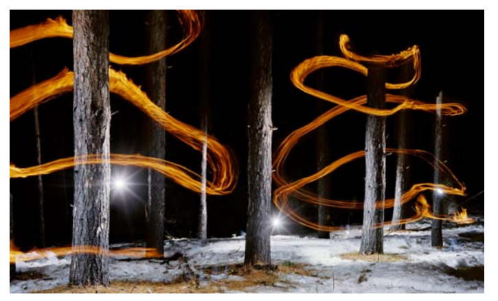
"Present in Absence 03", Amanda Arcuri, 45in. x 27in., 2008